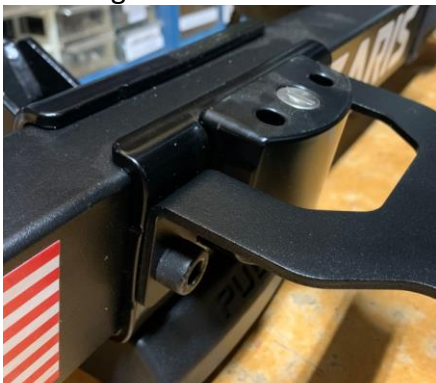
Set Bracket and Install hardware