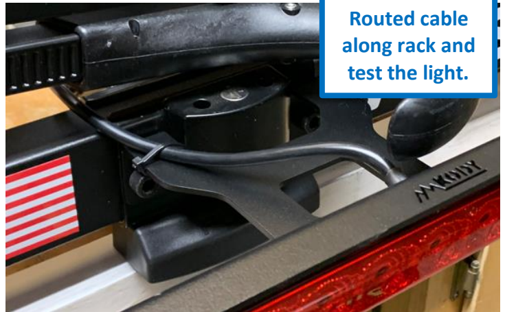
Routed cable along rack and test the light.