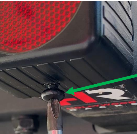
Remove End Cap & Phillips Screw