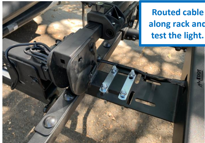
Routed cable along rack and test the light.