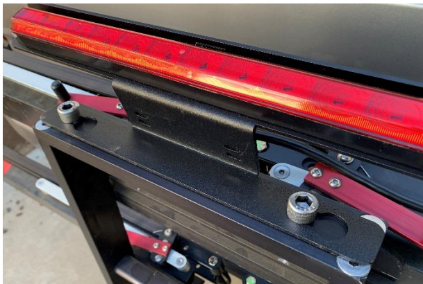
Rack Light Secured