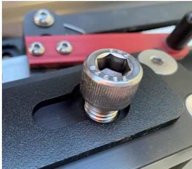
Partially Threaded Screw with Bracket