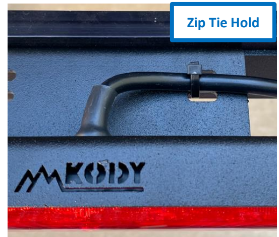
Zip Tie Hold